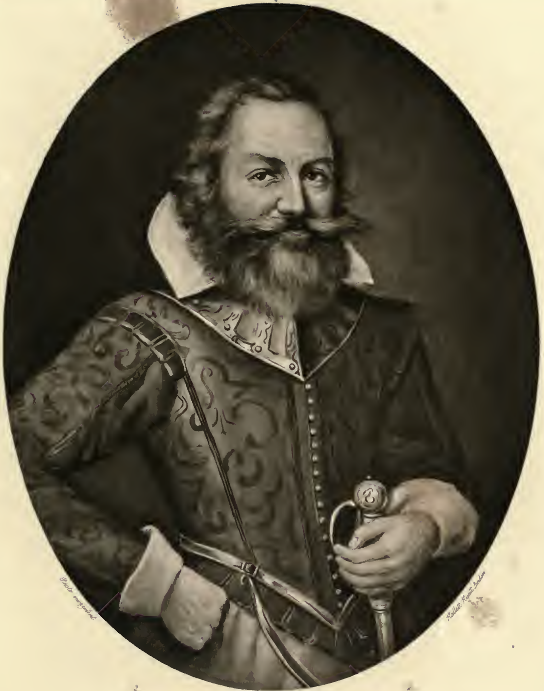
Captain John Smith.